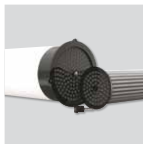
Tubular heat exchanger 100 or 150 mm.