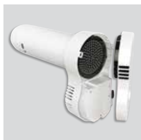
Maintenance and cleaning Easy access.